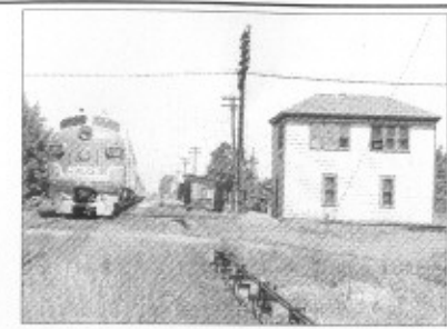
LaCrosse Tower – Gone..

Below is a cut-out form if you should choose to make a contribution towards this project. HVRM is a non-profit organization and operates under the stewardship of many dedicated volunteers. We thank you for taking the time to read about this project and considering helping out with a financial gift.