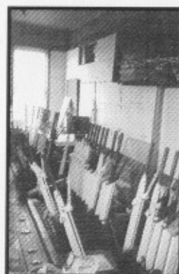
Inside Grasselli Lever Bed ▶