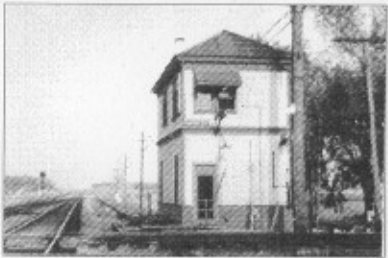
Hamlet Tower – Gone..