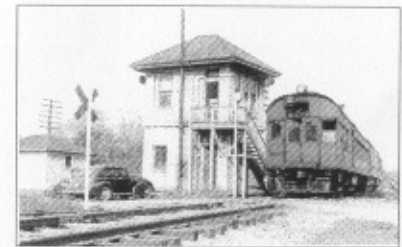
DeLong Tower – Gone..