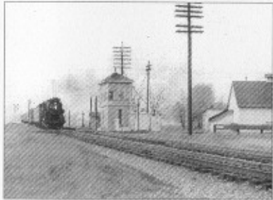
Knox Tower – Gone..