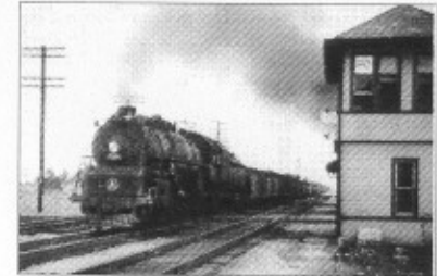
Wellsboro Tower – Gone..