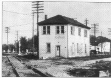
North Judson Tower – Gone..